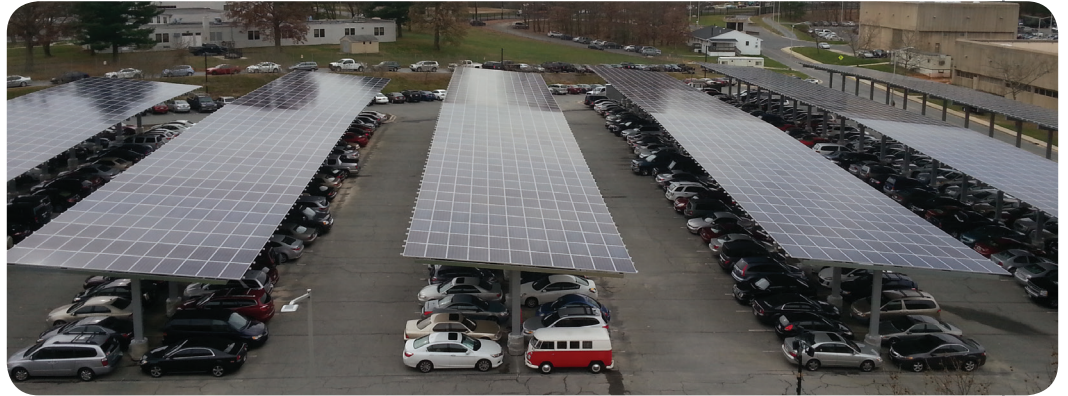
Adelphi Laboratory Center, Adelphi, MD

As part of a multi-phase partnership focused on energy savings, Ameresco provides ongoing maintenance services to the U.S. Army Research Laboratory Adelphi Laboratory Center. Ameresco emphasizes quality over the full life cycle of facility energy infrastructure, including maintenance for major equipment such as chillers, rooftop HVAC units, boiler burners, 2.2 MW CHP plant, solar PV, rainwater harvesting, and heat recovery equipment. Additionally, Ameresco holds maintenance contracts for the base-wide DDC control system and air compressor. Ameresco mechanics are prepared to self-perform and coordinate third party expertise ensured specialty subcontractors for the unique and demanding systems operating. Over the course of Ameresco's partnership with the Army at Adelphi, the site has reduced its energy consumption by 50%.