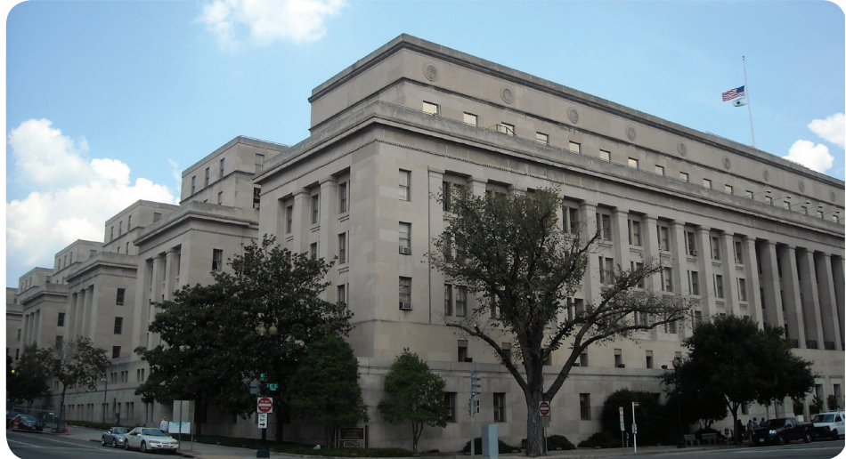
Department of the Interior, Main Interior Building, Washington, DC

Ameresco's best-in-class O&M services delivers outstanding energy service, savings and support to The Department of the Interior's Headquarters in Washington, DC. Our comprehensive work, including ongoing facility management as part of an Energy Savings Performance Contract (ESPC), highlighted Ameresco's attention, knowledge and teamwork. Overall, our energy and O&M services produced over $4 million in annual savings. On-the-ground, facility work included around-the-clock O&M, preventative maintenance, repairs, quality assurances, energy performance and building alterations. Key service areas, including the combined heat and power (CHP) plant, chiller plant, heating, ventilation and air conditioning (HVAC) and direct digital controls (DDC) systems, lighting, electrical, plumbing and water systems, and carpentry, showcase Ameresco's ability to optimize the performance and useful life of building systems.