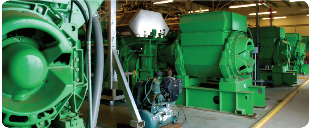
Ox Mountain Land Fill Gas Energy plant in California

Ameresco's energy expertise and O&M services are contributing to the State of California's clean energy transformation. As a widely recognized leader in energy solutions with a model for comprehensive and sustainable O&M offerings, Ameresco's expertise was tapped to design and build, and now own and operate the Ox Mountain Land Fill Gas Energy plant. Today, Ameresco serves the landfill owner, Republic Services, in their commitment to collect the landfill gas in order to reduce methane emissions. The plant, one of the largest in the Bay Area, produces 11.4 MW and returns an output sold to existing customers and project planners such as Alameda Municipal Power (AMP) and the City of Palo Alto. Improving upon the commitment to collect landfill gas and reduce methane emissions beyond expectations, Ameresco's on-going O&M service yields 18MW of renewable energy in the AMP and City portfolios. Even more impressive, the project showcases a reduction of 66,139 tons of CO 2 .